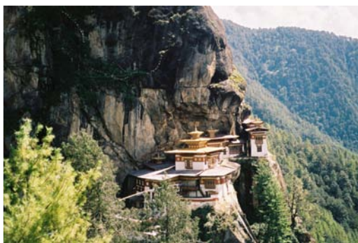
The Taktshang Monastery, also known as the "Tiger's Nest" is perched impossibly high on a cliff face at 3,120m

The Kiwi Diary 2010 is a little beauty, BRIMMING with inspiring, useful and entertaining information. Enjoy beautiful images and stories, quotes and facts, recipes and history, breathtaking photography, and all things Kiwi! With contributions from talented guest artists, writers and photographers, The Kiwi Diary epitomises Aotearoa style. The perfect Xmas gift for friends, family, colleagues and Kiwis all over the world.